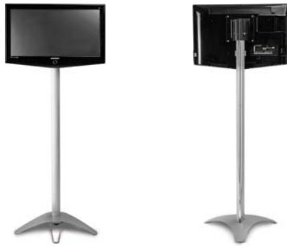
Expand MonitorStand freestanding with monitor