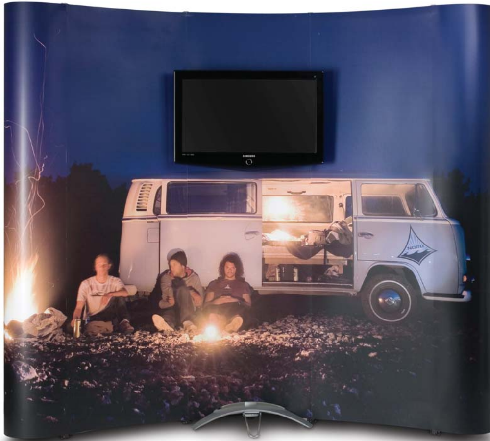
When the product is used with Expand 2000, the panels are cut to fit the foot and the monitor.