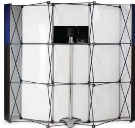
A view of the Expand 2000 from the back with an integrated Expand MonitorStand.