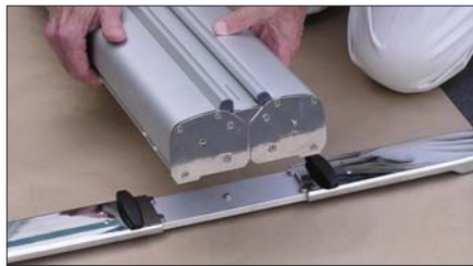
At the Left: The weighted, support feet mount easily to the base, providing stability on flat surfaces such as snow, grass, sand, pavement and concrete.