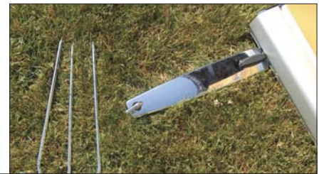
At the Right: Optional stakes are available for additional stabilization on soft surfaces such as snow and grass.