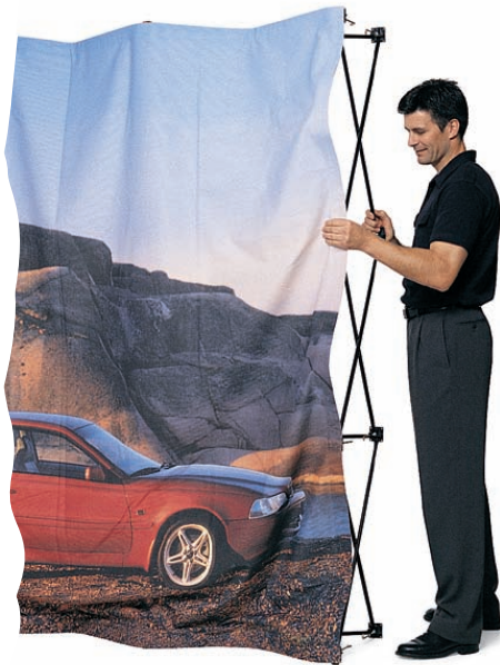
3. Connect all of the metal hooks