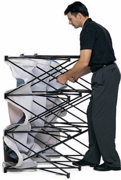
2. Open the frame