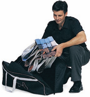
1. Open the nylon bag and remove the frame